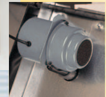
Low Pressure Fan Motor