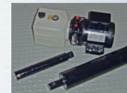
Motor & Cylinders